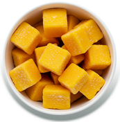
FROZEN TEJC MANGO