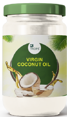
Virgin Coconut Oil