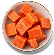
FROZEN RED PAPAYA