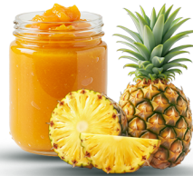
FROZEN PINEAPPLE PULP