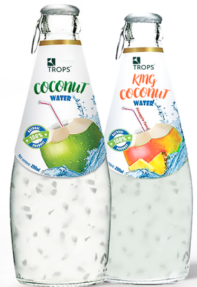
Coconut Water / King Coconut Water