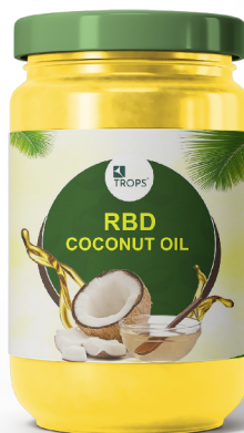
RBD Coconut Oil