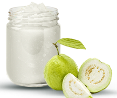
FROZEN GUAVA PULP