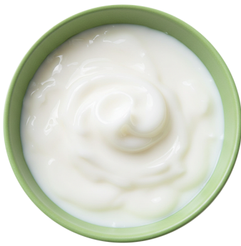
Coconut Milk & Cream

Trops provides branded and private-label products, featuring tailored fat content to meet specific dietary and formulation needs.