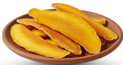
DEHYDRATED TEJC MANGO