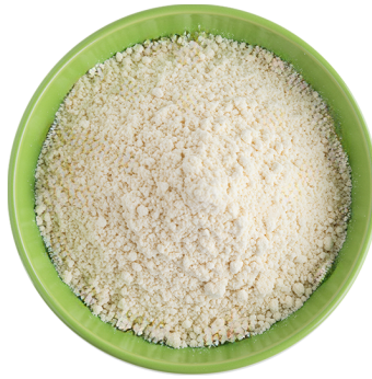
Coconut Milk Powder