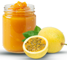
FROZEN PASSION FRUIT PULP