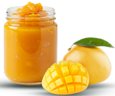
FROZEN TEJC MANGO PULP